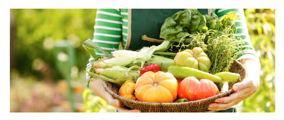
"If it came from a plant, eat it; if it was made in a plant, don't." -Michael Pollan