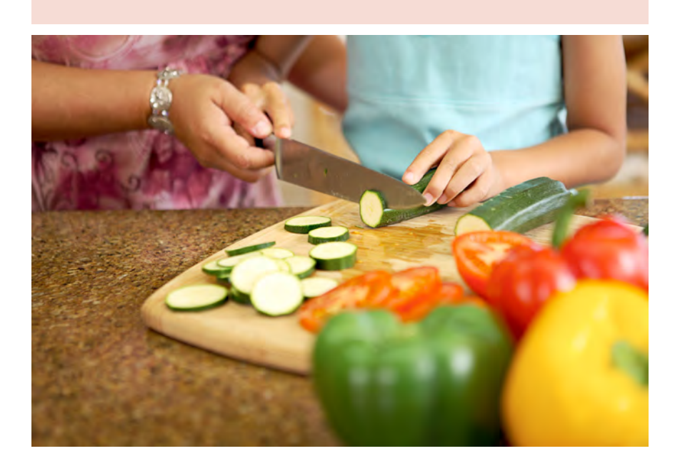
"Eat food. Not too much. Mostly plants." – Michael Pollan

If you answered "yes" to any of these questions, then a plant-based eating plan may be for you. This booklet includes information to help you follow a low-fat, whole foods, plant-based diet.